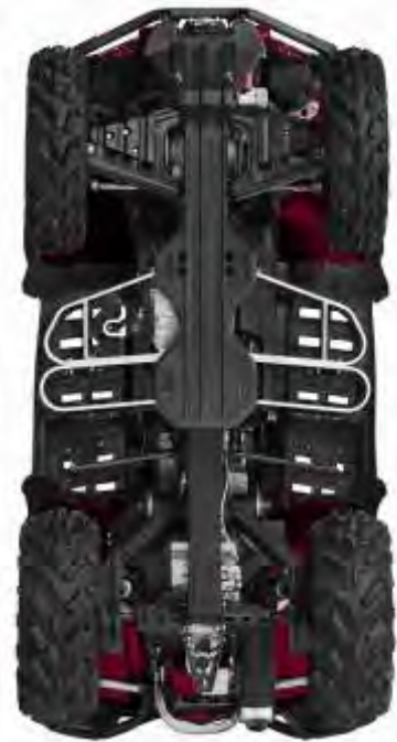
New Center Skid Plate